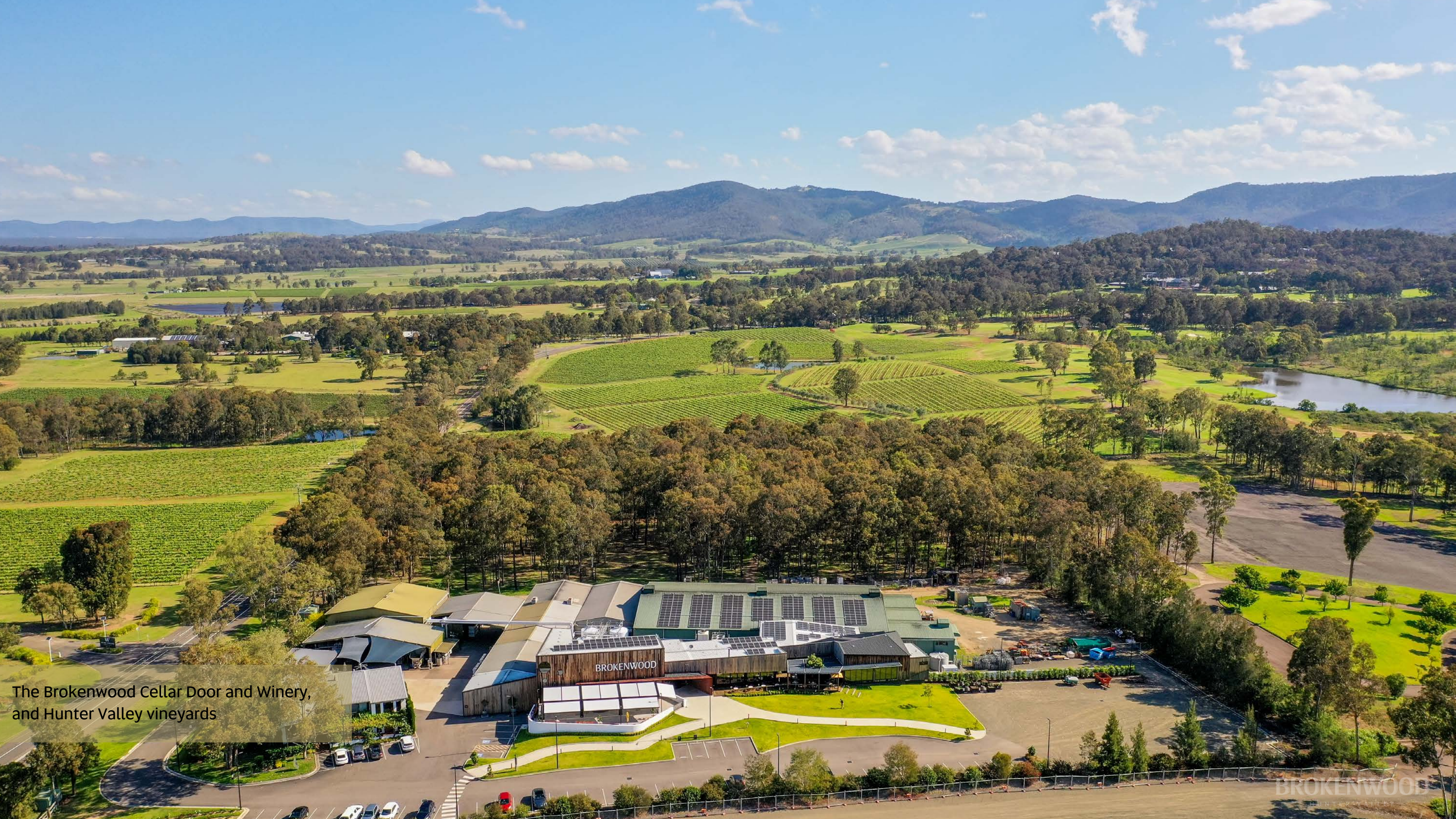
The Brokenwood Cellar Door and Winery, and Hunter Valley vineyards