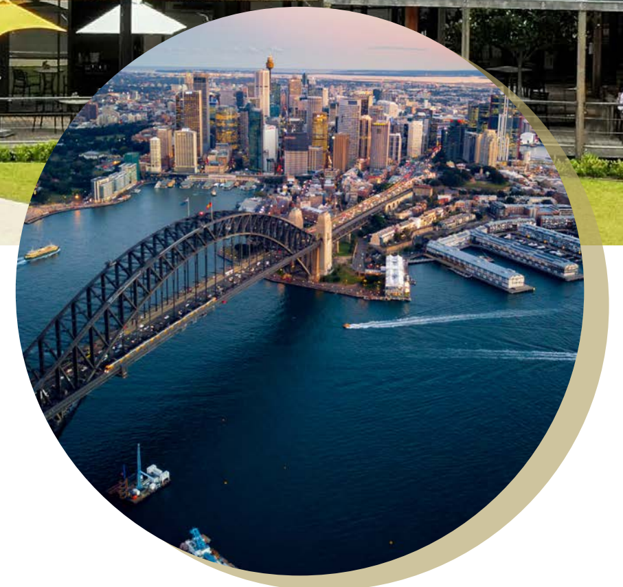
Brokenwood Wines 2 hours north of Sydney