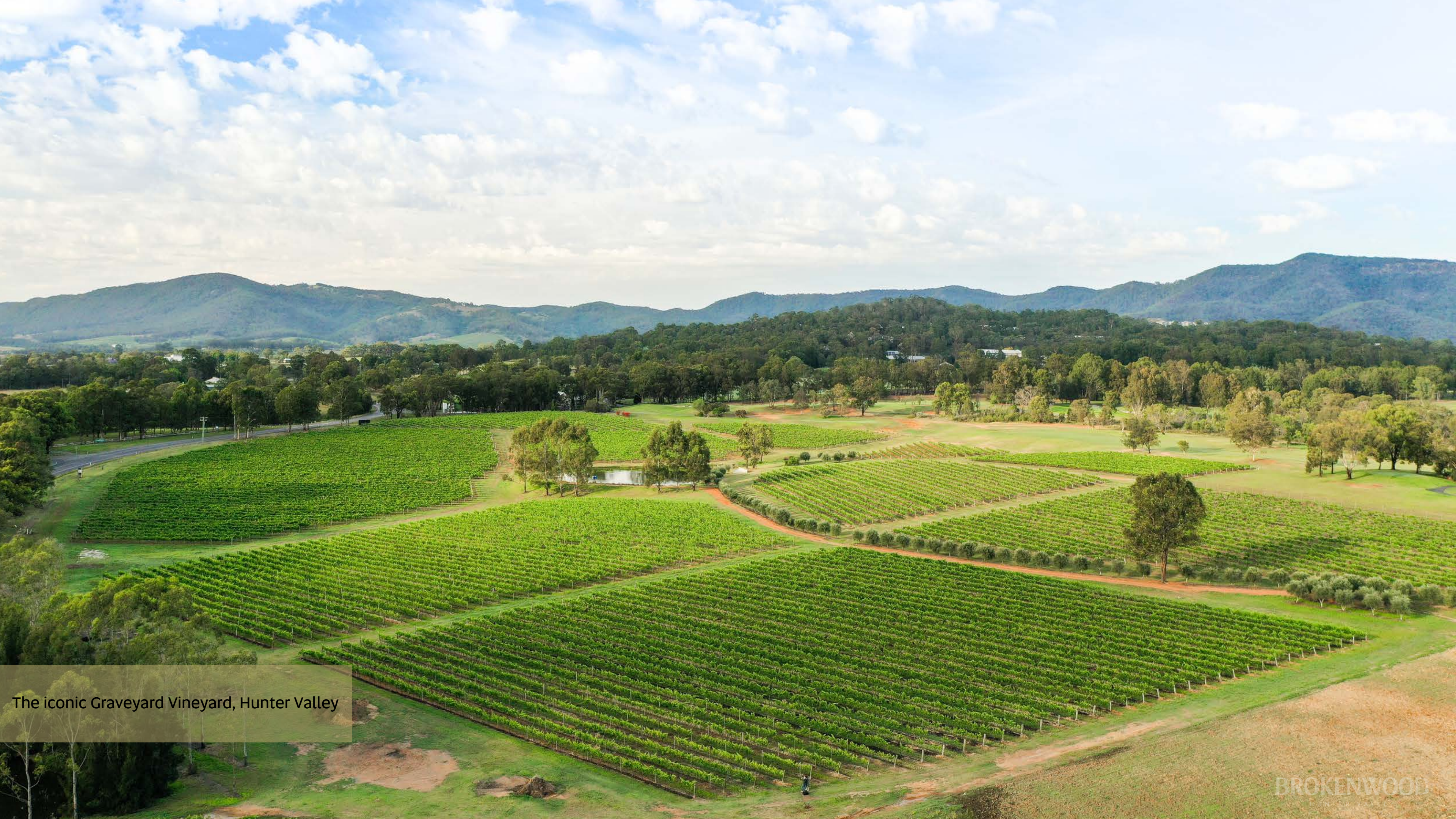
The iconic Graveyard Vineyard, Hunter Valley