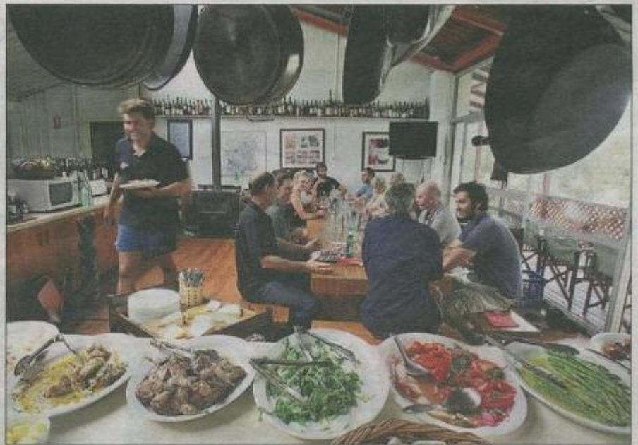
SECRETS: The industry representatives at Brokenwood Wines yesterday.